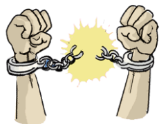
Human Trafficking Awareness