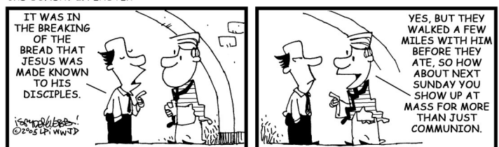
3RD SUNDAY IN EASTER

Rejoice in hope, endure in affliction, persevere in prayer. (Romans 12:12)